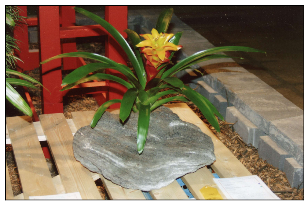
The Chicago Botanic Garden had a judged show at the Chicago Flower Show.

The "Bromeliaceae" newsletter from the fourth quarter of 2019 had these summer tips: