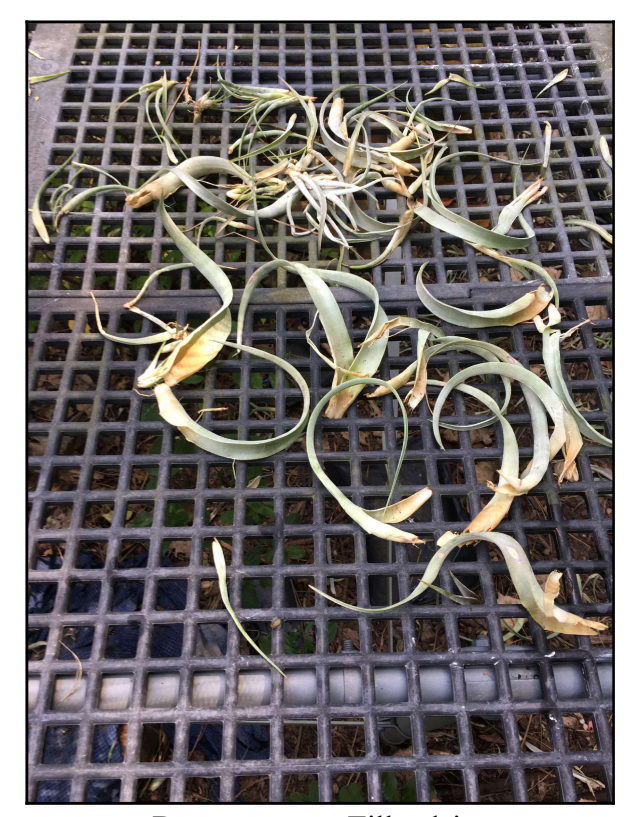
Damage to my Tillandsias

It was a disaster for the plants I had taken outside to my shadehouse. First, an animal shredded many of my tillandsias. That should have been a warning to me. The next night the squirrel or raccoon shredded my potted bromeliads. He didn't even take a bite of them. He must be an angry animal. Maybe he has been listening to all the news or maybe it was a young immature one. I found the following in an old Newsletter from Tampa Bay, Prior to 1999